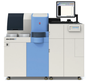
AIA-2000 200 Tests Per Hour