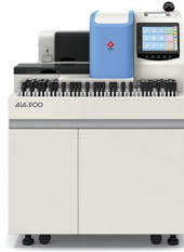
AIA-900 Loader Model 90 Tests Per Hour