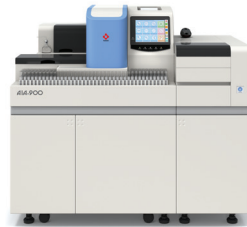
AIA-900 with 9 tray sorter 90 Tests Per Hour Also available with 19 tray sorter