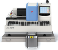
AIA-900 Benchtop 90 Tests Per Hour